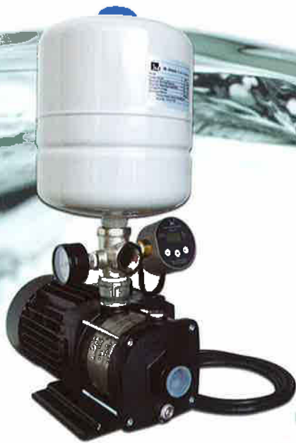
Model : JHCPT with DPC10 + JST 型号 : JHCPT - 电子压力开关+压力桶