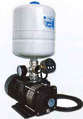
Model : JHCPT with DPC10 + JST 型号 : JHCPT-电子压力开关+压力桶