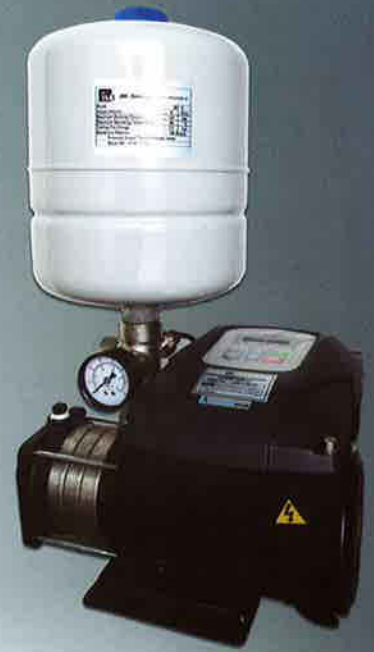
Model : JHCVSPT with inverter 型号 : JHCVSPT-变频+压力桶