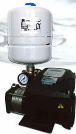
Model : JHCVSPT with Inverter 型号 : JHCVSPT-变频+压力桶